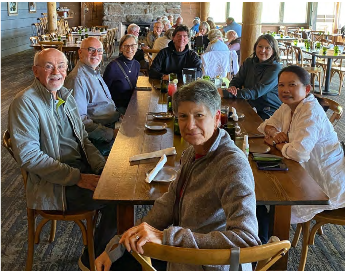
After a day of driving, a good meal was most welcome.