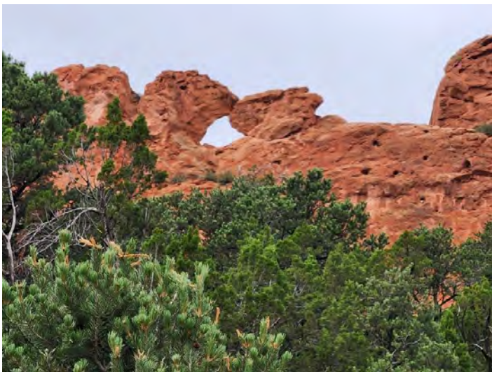
Kissing camels rock formation