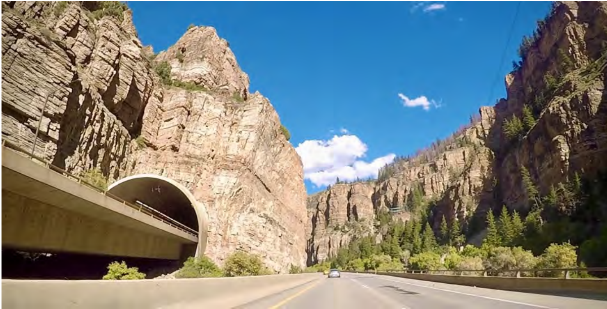
The group encountered all kinds of weather. But days like this were the best.