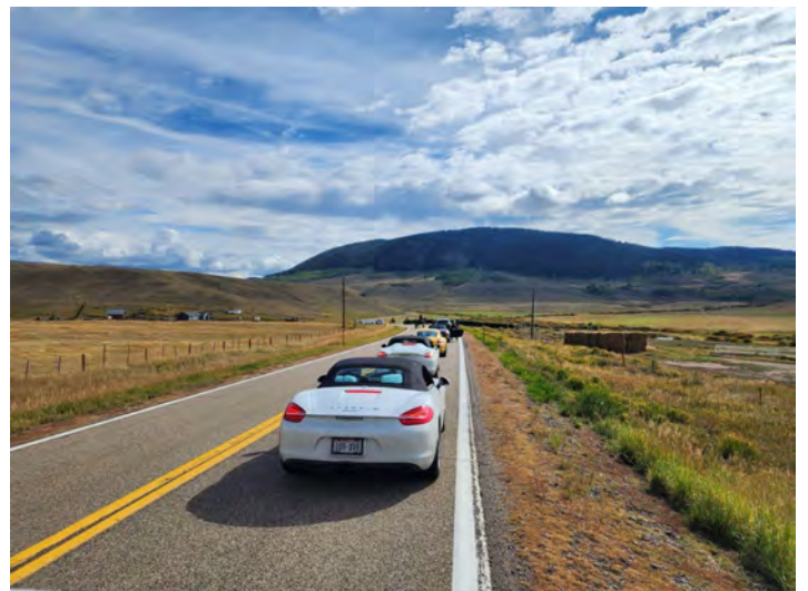
Waiting for the cattle to clear the road.