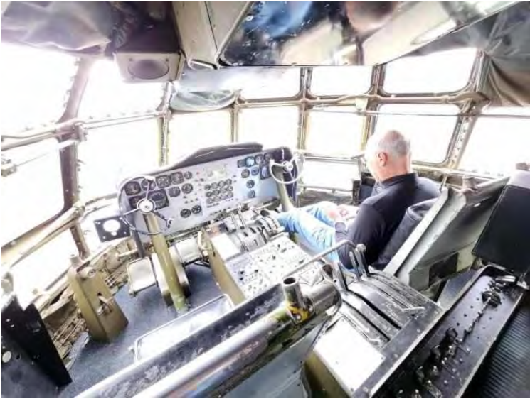
Rich and Roberta Hegy found an interesting restaurant that included the cockpit and exterior of an airplane. Besides being Porsche drivers, the Hegys are also pilots.