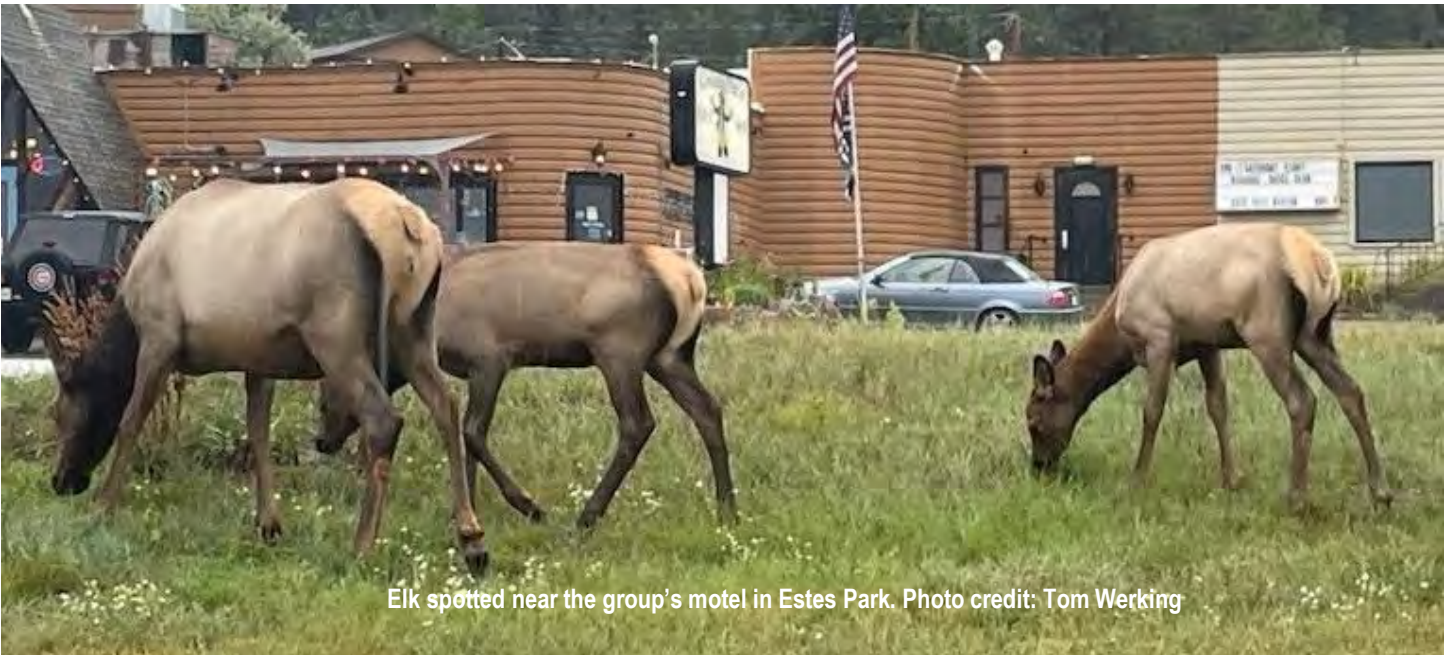
Elk spotted near the group's motel in Estes Park.

Editor's note: Thanks to the Colorado tour participants for sending me dozens of photos. Some arrived via text, others by email. Some came while the tour was under way. Others came later. All were appreciated.