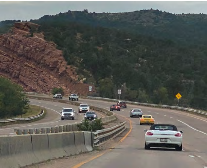
On the road surrounded by scenic views.