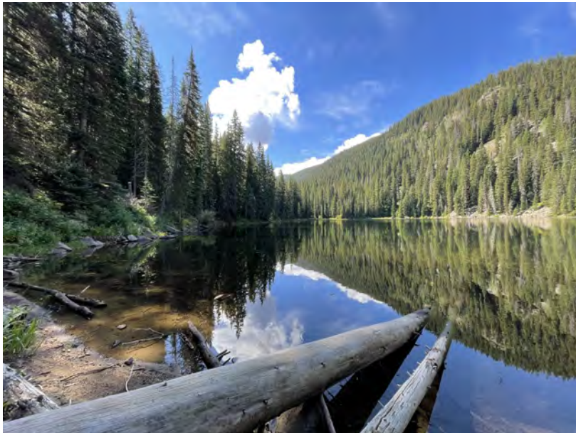
Hiking to Beaver Lake rewarded Patty and Roger Franzel with this view.