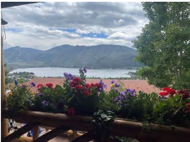
The view from Grand Lake Lodge.