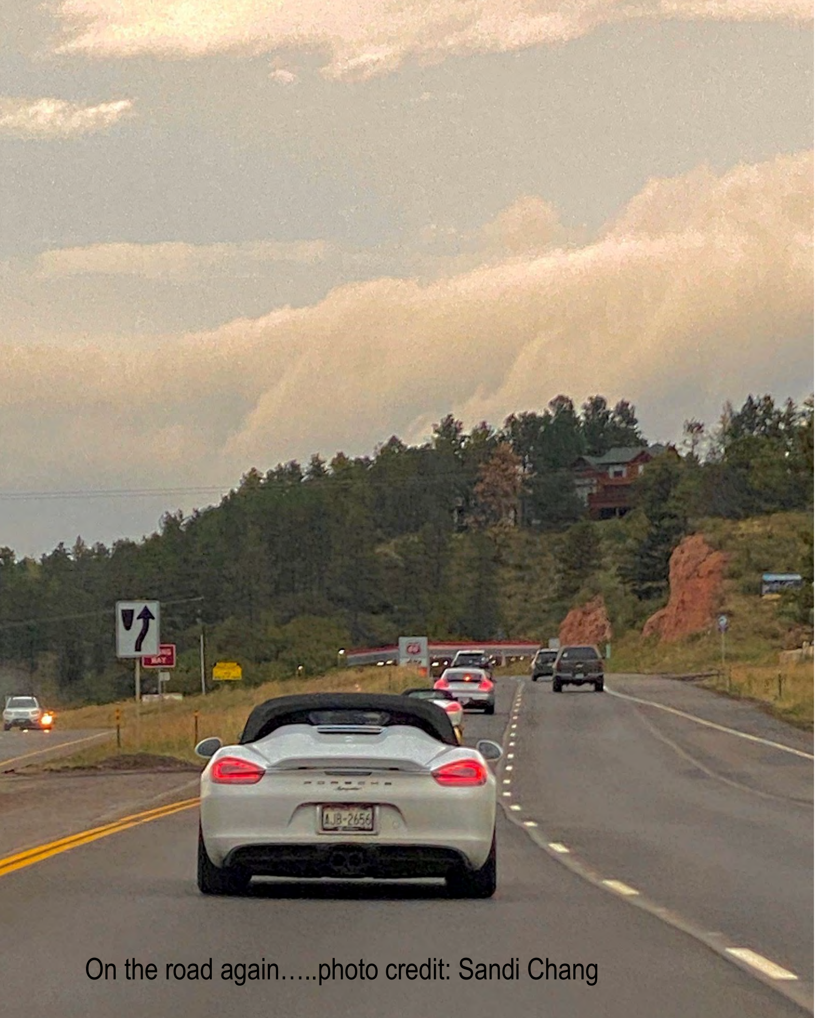
On the road again.....