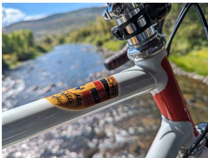
Not all touring was done in Porsches. Matt Klucha, Chicago region member, found time to cycle on back roads during the trip.