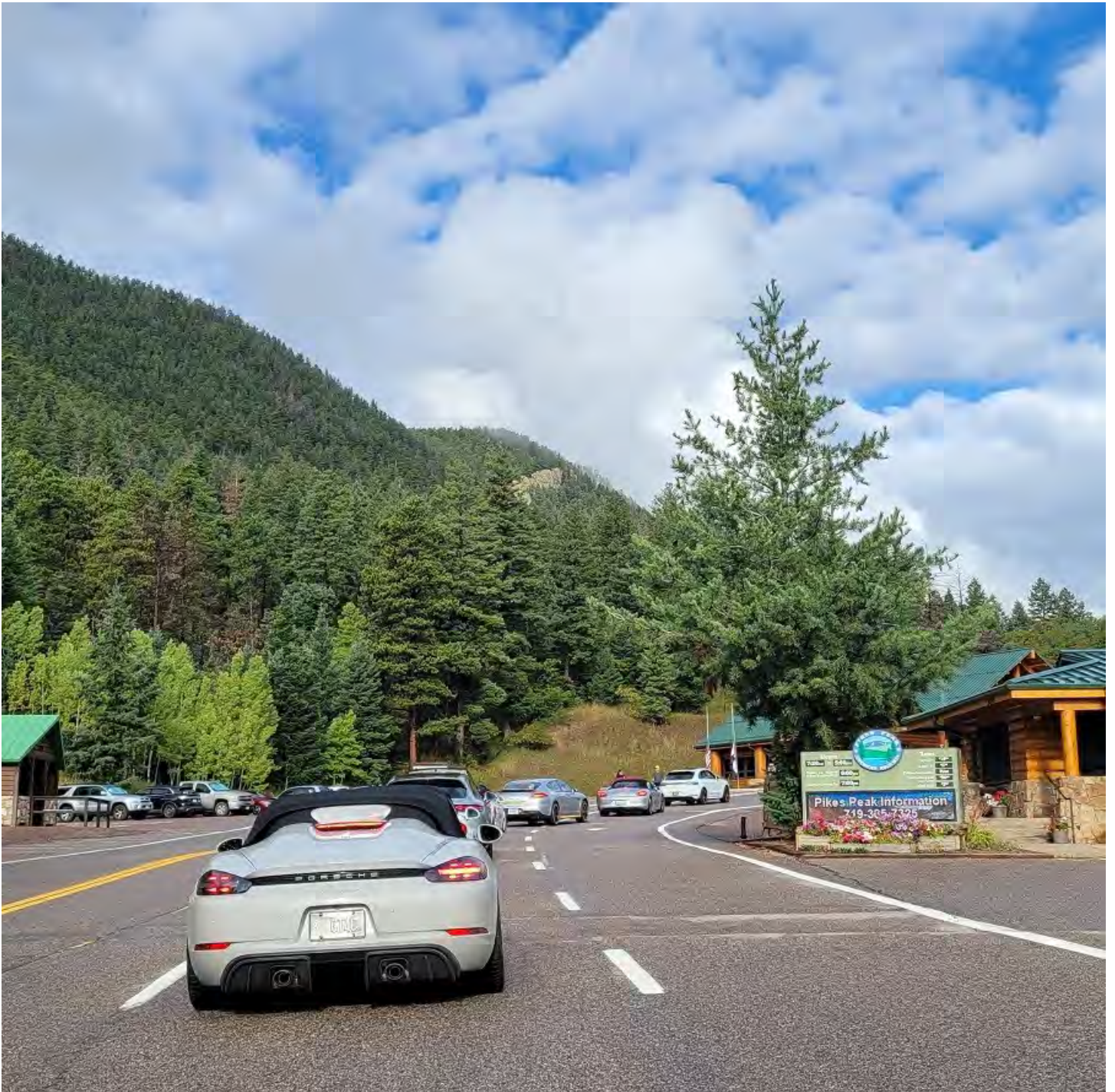
Arriving at the Pike's Peak visitor center. Snow awaits the group's arrival at the top.

Visiting Pike's Peak was one of many highlights for the tour group. They also visited Independence Pass and Trail Ridge Road in Rocky Mountain National Park.