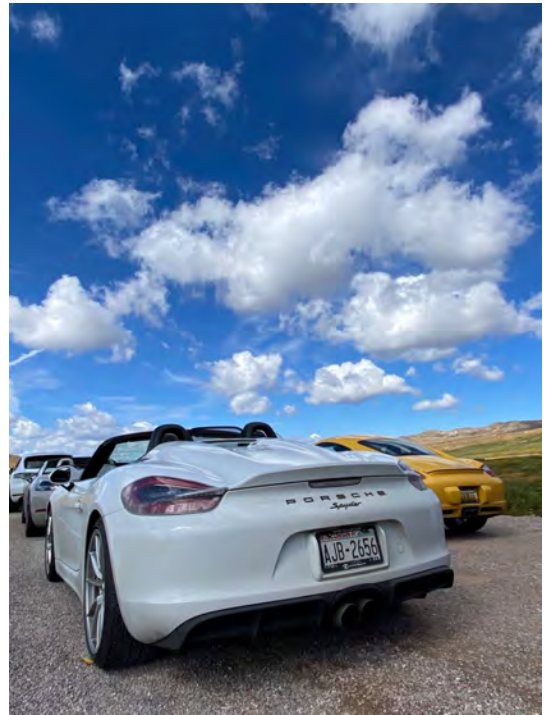
Sunny skies were welcome after the visit to Pike's Peak.