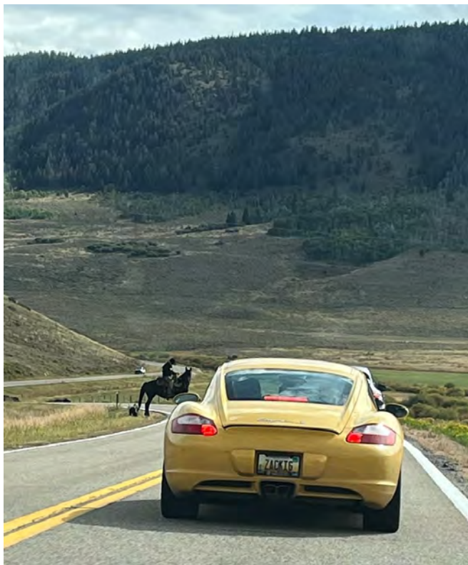
While driving to Grand Lake, region members encountered a cattle drive, forcing them to stop on the highway. The cowboys and herding dogs made the stop relatively short. Surely a unique sight and one that made this tour memorable.