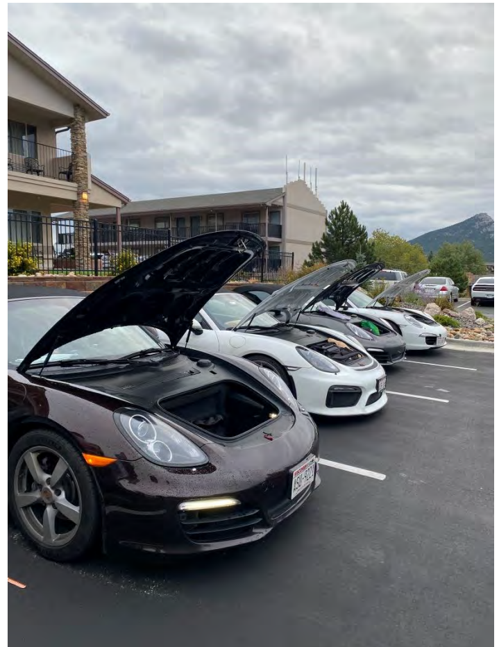
Funks are open and ready to be filled on departure day.