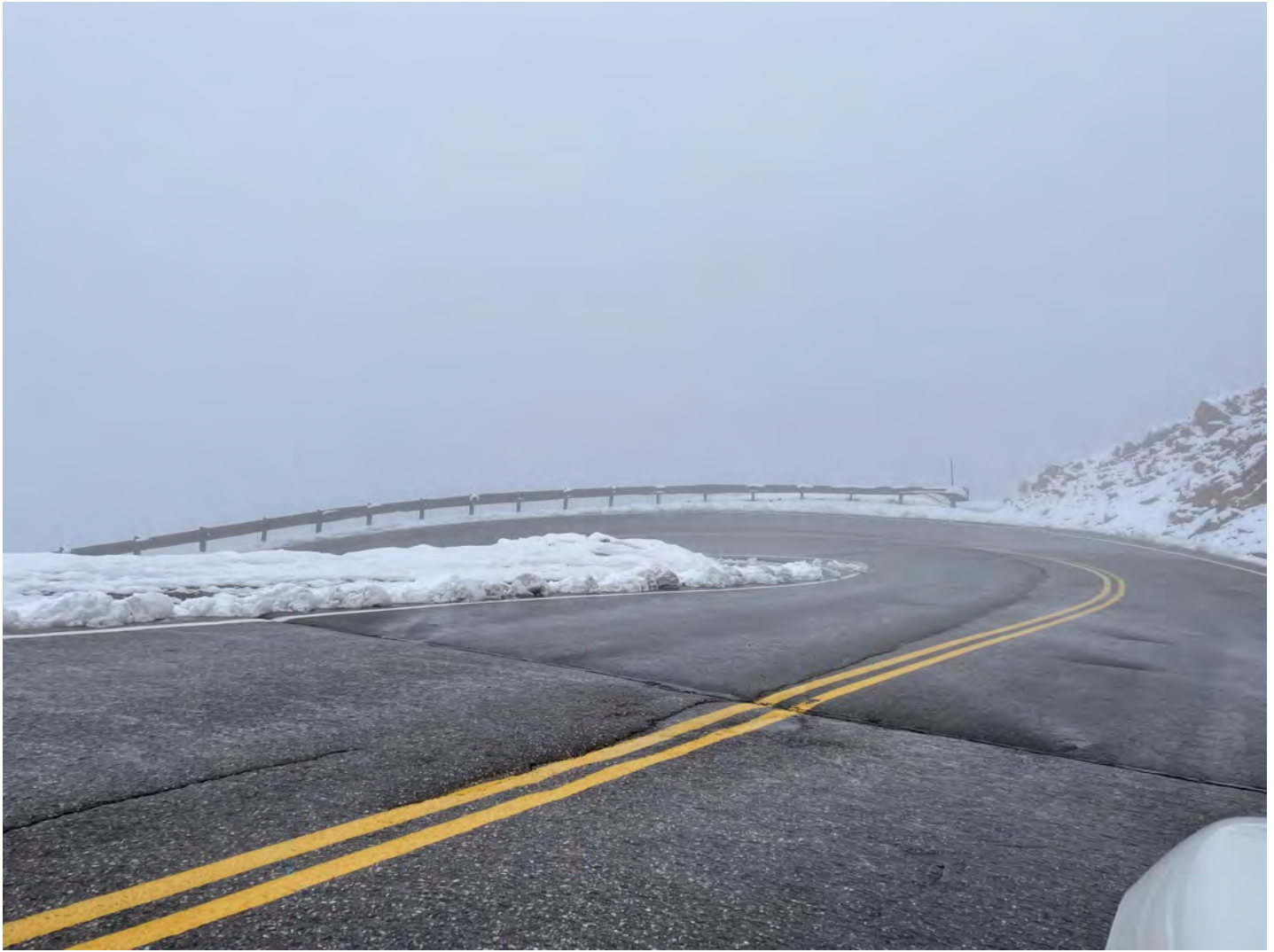
Leaving Pike's Peak. The group was happy to reach the summit and head back to warmer weather.