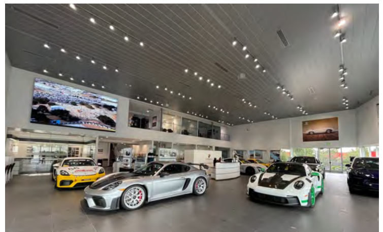
Some of the participants made a visit to Porsche Colorado Springs where they received excellent service.